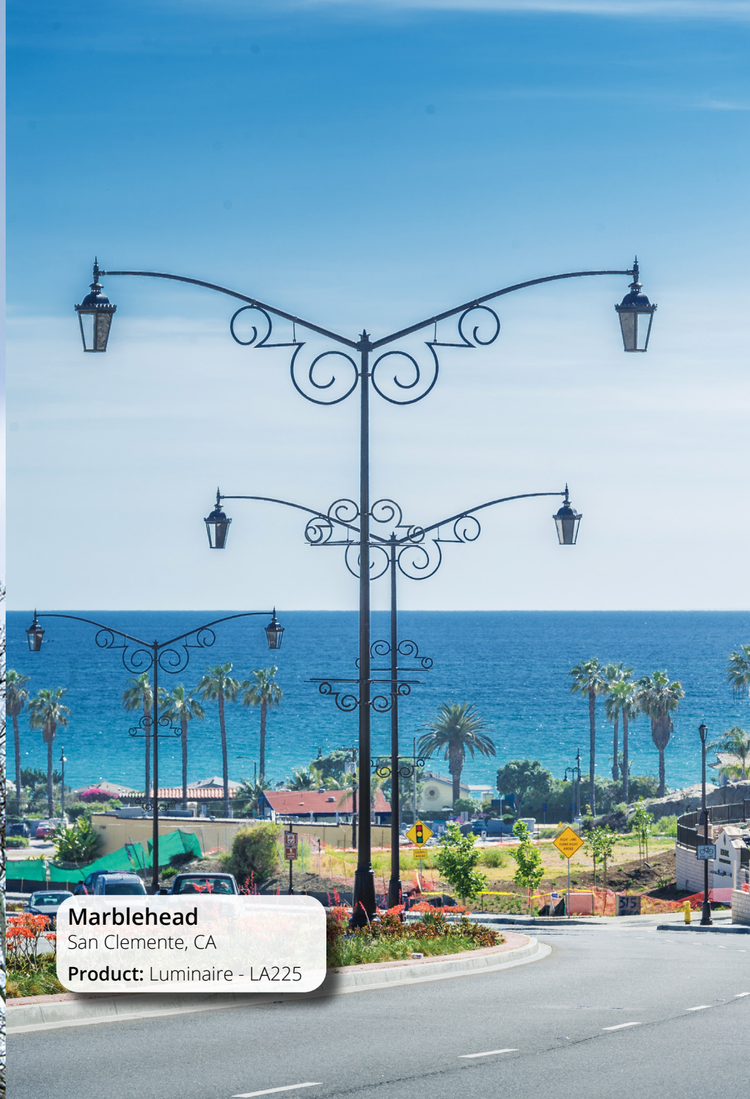
Marblehead San Clemente, CA Product: Luminaire - LA225