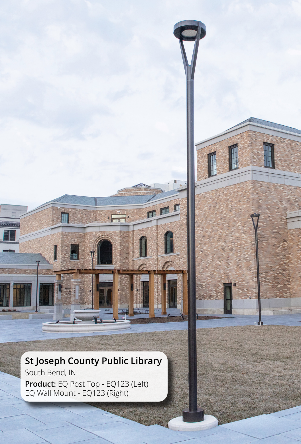
St Joseph County Public Library South Bend, IN Product: EQ Post Top - EQ123 (Left) EQ Wall Mount - EQ123 (Right)