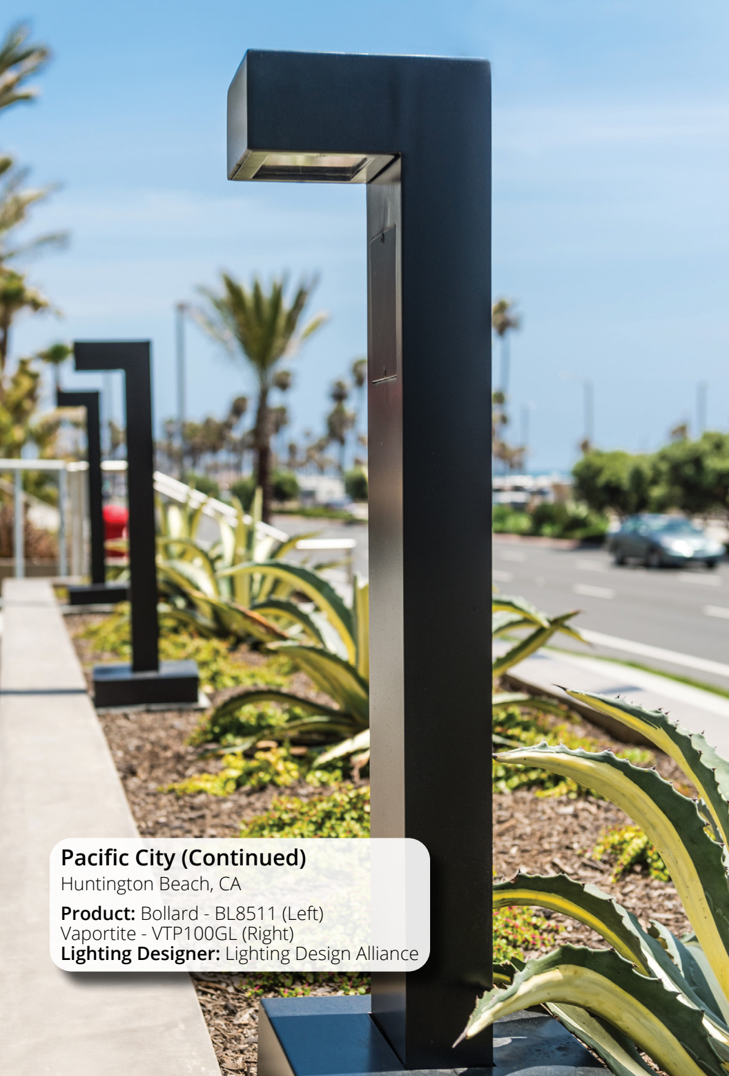
Pacific City (Continued) Huntington Beach, CA Product: Bollard - BL8511 (Left) Vaportite - VTP100GL (Right) Lighting Designer: Lighting Design Alliance