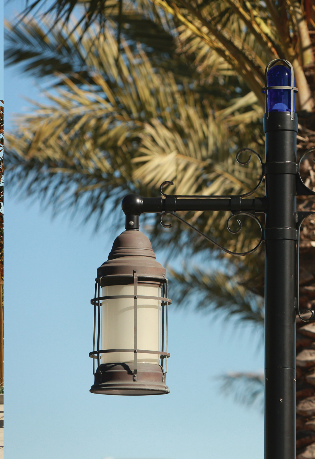
City of Dana Point Dana Point, CA Product: Custom lantern & colored glass