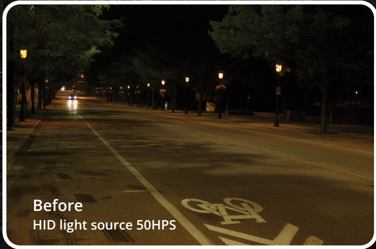
Before HID light source 50HPS