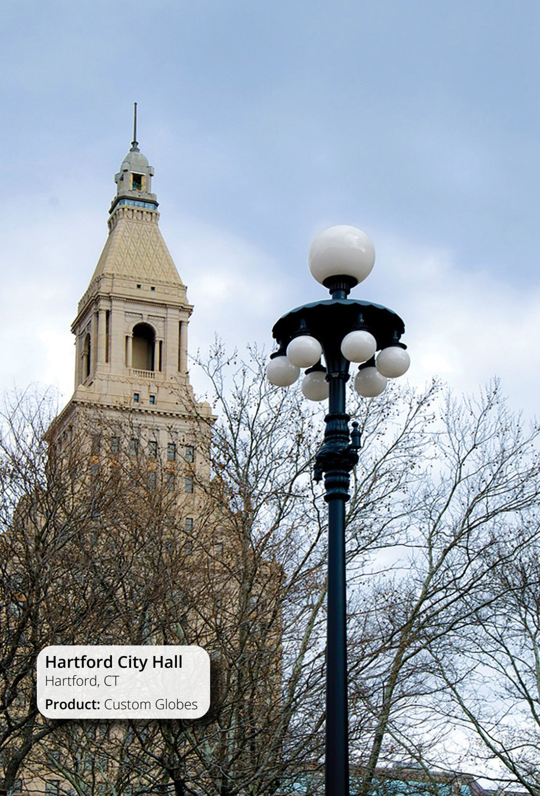
Hartford City Hall Hartford, CT Product: Custom Globes