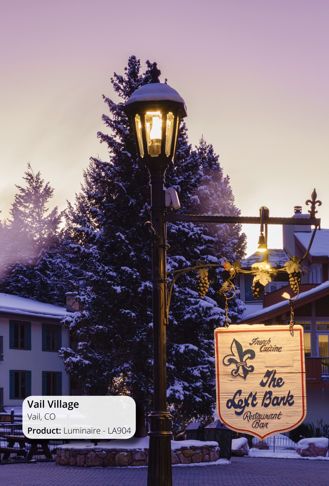
Vail Village Vail, CO Product: Luminaire - LA904