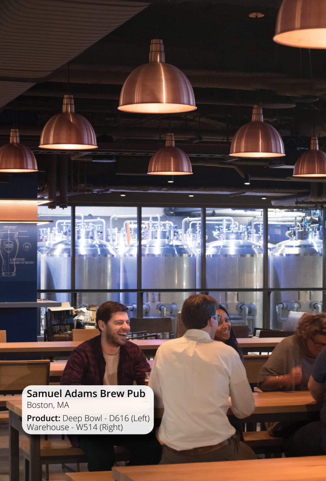
Samuel Adams Brew Pub Boston, MA Product: Deep Bowl - D616 (Left) Warehouse - W514 (Right)