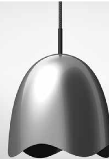
MAGNOLIA 12", 16", 20" or 24"