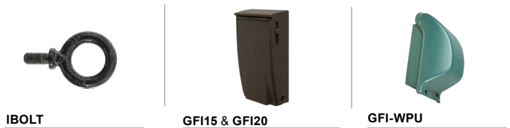
IBOLT GFI15 & GFI20 GFI-WPU