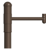
PA3321 / 18" x 14 3/4"