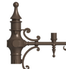
PA7711 / 13 1/8" x 21 1/2"