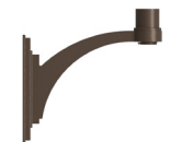
WM5161 / 15 3/4" x 17 3/4"