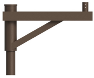
PA3111 / 25" x 15 1/4"