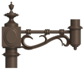
PA7911 / 20" x 20 5/8"