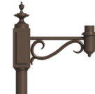
PA8031 / 20 1/2" x 20 1/4"