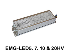
EMG-LED5, 7, 10 & 20HV