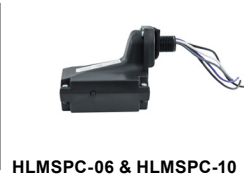
HLMSPC-06 & HLMSPC-10