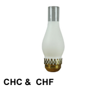
CHC & CHF