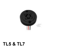
TL5 & TL7