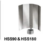
HSS90 & HSS180