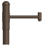
PA3321 / 18" x 14 3/4"