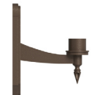
WM5131 / 11" x 16 3/8"