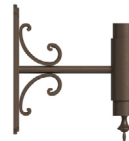
WM3351 / 14 1/2" x 17"