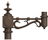
PA7911 / 20" x 20 5/8"