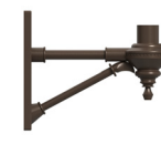
WM7421 / 16 3/8" x 15 3/4"