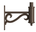
WM8021 / 19 1/4" x 16 3/8"