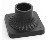
CM / 5 3/4" SQ x 3 1/2" H