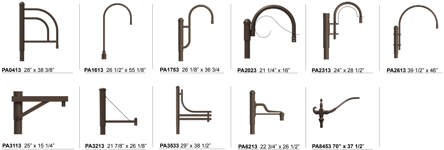
PA0413 28" x 38 3/8" PA1613 26 1/2" x 55 1/8" PA1753 26 1/8" x 36 3/4" PA2023 21 1/4" x 16" PA2313 24" x 28 1/2" PA2613 39 1/2" x 46" PA3113 25" x 15 1/4" PA3213 21 7/8" x 26 1/8" PA3533 29" x 38 1/2" PA6213 22 3/4" x 26 1/2" PA8453 70" x 37 1/2"