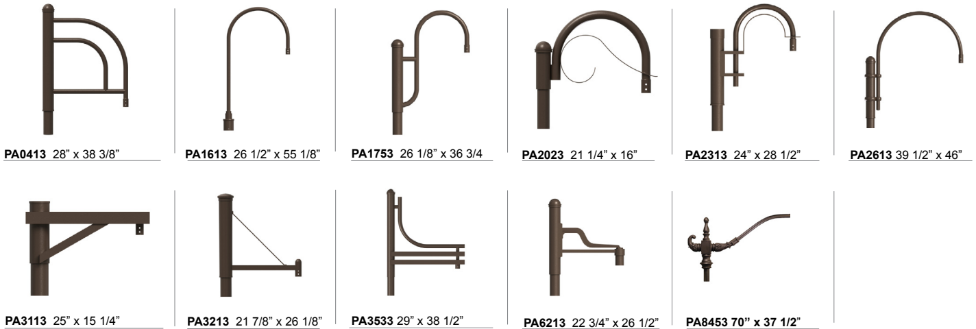
PA0413 28" x 38 3/8" PA1613 26 1/2" x 55 1/8" PA1753 26 1/8" x 36 3/4" PA2023 21 1/4" x 16" PA2313 24" x 28 1/2" PA2613 39 1/2" x 46" PA3113 25" x 15 1/4" PA3213 21 7/8" x 26 1/8" PA3533 29" x 38 1/2" PA6213 22 3/4" x 26 1/2" PA8453 70" x 37 1/2"