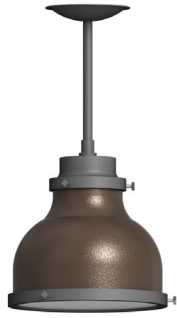
MA08 8" Madison - LED