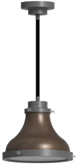
MA10 10" Madison - LED