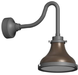
MA10 10" Madison - LED