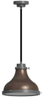
MA12 12" Madison - LED