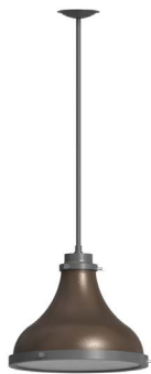
MA14 14" Madison - LED