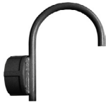
WM40 | 13 7/8" x 14 3/4"