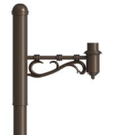
PA5621 / 19" x 26 1/4"