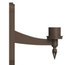
WM5131 / 11" x 16 3/8"