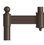
PA8521 / 18 1/4" x 14 1/2"