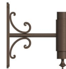
WM3351 / 14 1/2" x 17"