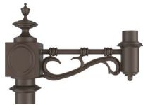
PA7911 / 20" x 20 5/8"